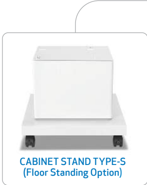
CABINET STAND TYPE-S (Floor Standing Option)