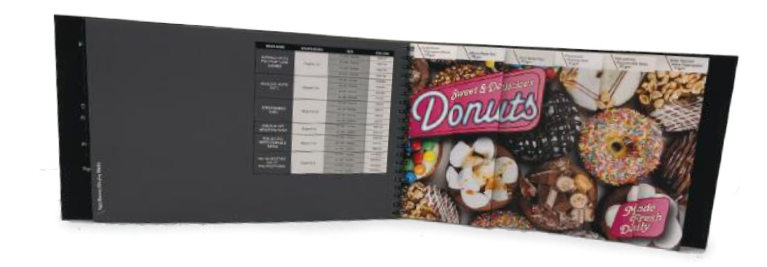
imagePROGRAF Specialty Media Swatch Book

For more information on Canon Media, please visit the Canon Consumables website at usa.canon.com/consumables/media.