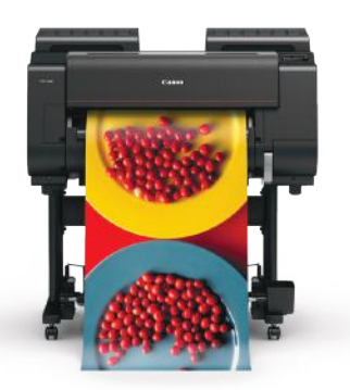
FINE ART PHOTOGRAPHY PROOFING

Whatever Your Needs, Canon Has The Large-Format Solution.