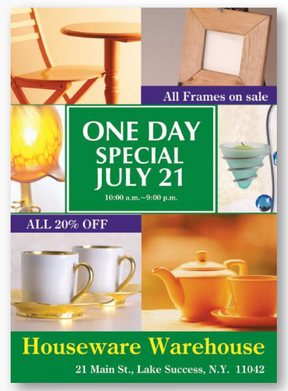
Created in PosterArtist