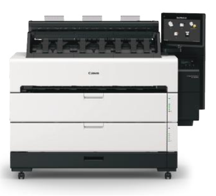
TECHNICAL DOCUMENTS GENERAL USE SIGNAGE SCANNING SOLUTIONS