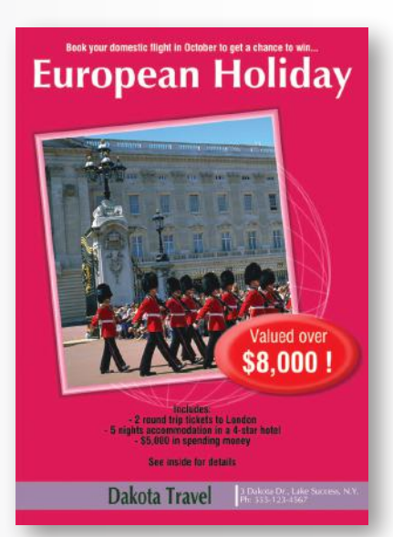
Created in PosterArtist