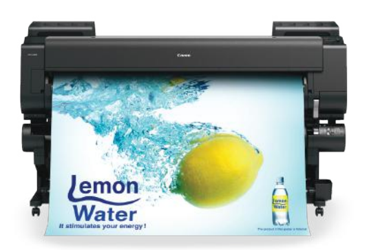
PRODUCTION SIGNAGE INFOGRAPHICS POSTERS