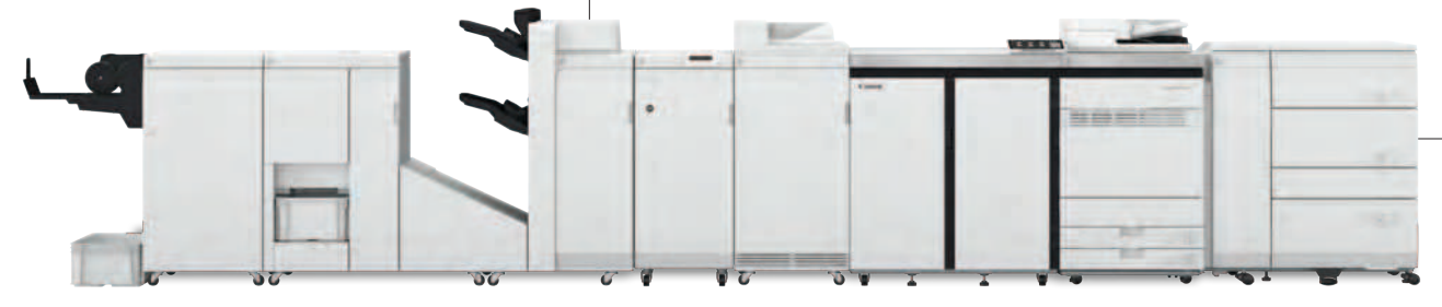
imagePRESS V1000 shown with optional accessories.