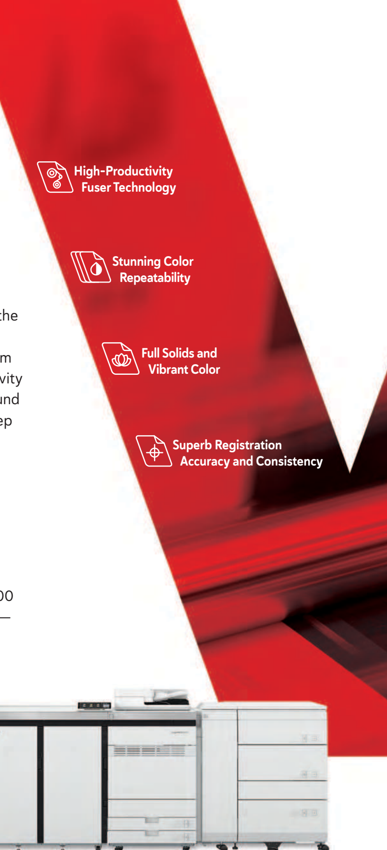
imagePRESS V1000 shown with optional accessories.

Quality. Versatility. Productivity. The imagePRESS V1000 digital press gives you the tools you need to compete—and thrive—in the demanding print world.