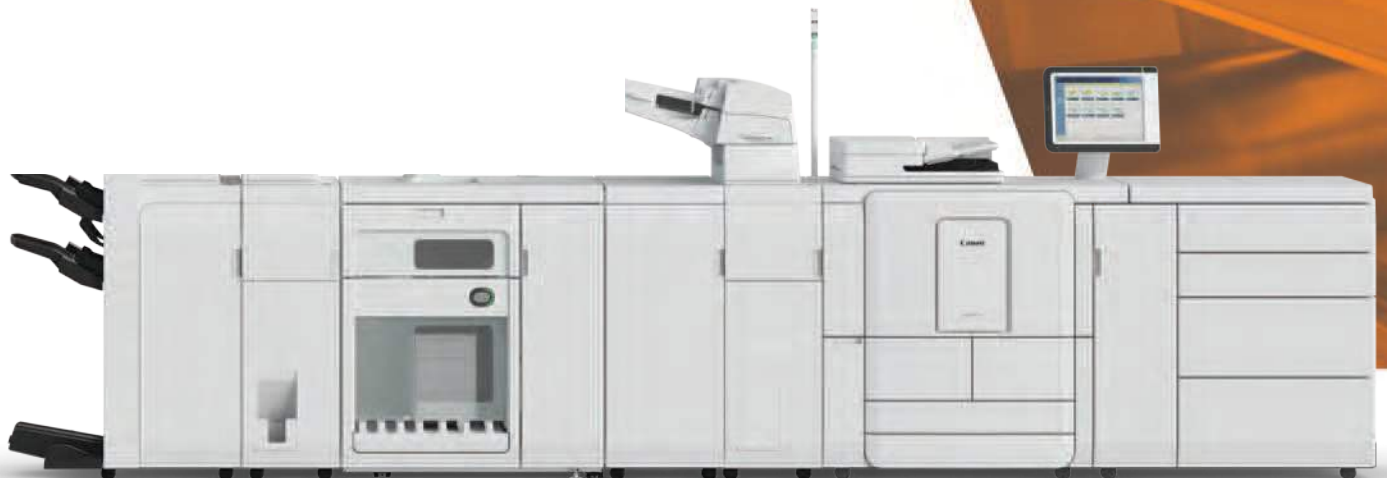
varioPRINT 140 QUARTZ shown with optional accessories.