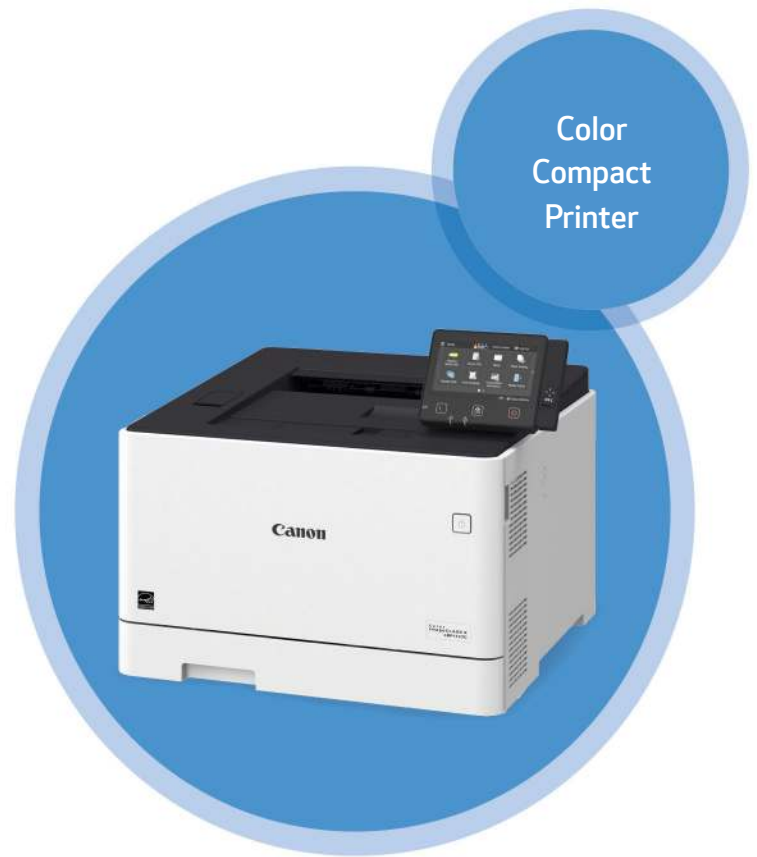
Color Compact Printer

Designed for small workgroups within an office or home environments used as part of an organization's extended print fleet, the Canon Color imageCLASS X LBP1127C printer balances speedy performance, minimal maintenance, and the ability to add an extra paper tray for busy groups. A 5" color touchscreen delivers an intuitive user experience and can be customized by a device administrator to simplify many daily tasks.