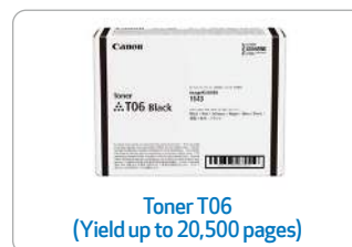
Toner T06 (Yield up to 20,500 pages)

Use of Canon GENUINE toner cartridges helps provide longer equipment life, high yields, reliable performance, high-quality output, and minimal jamming or issues.