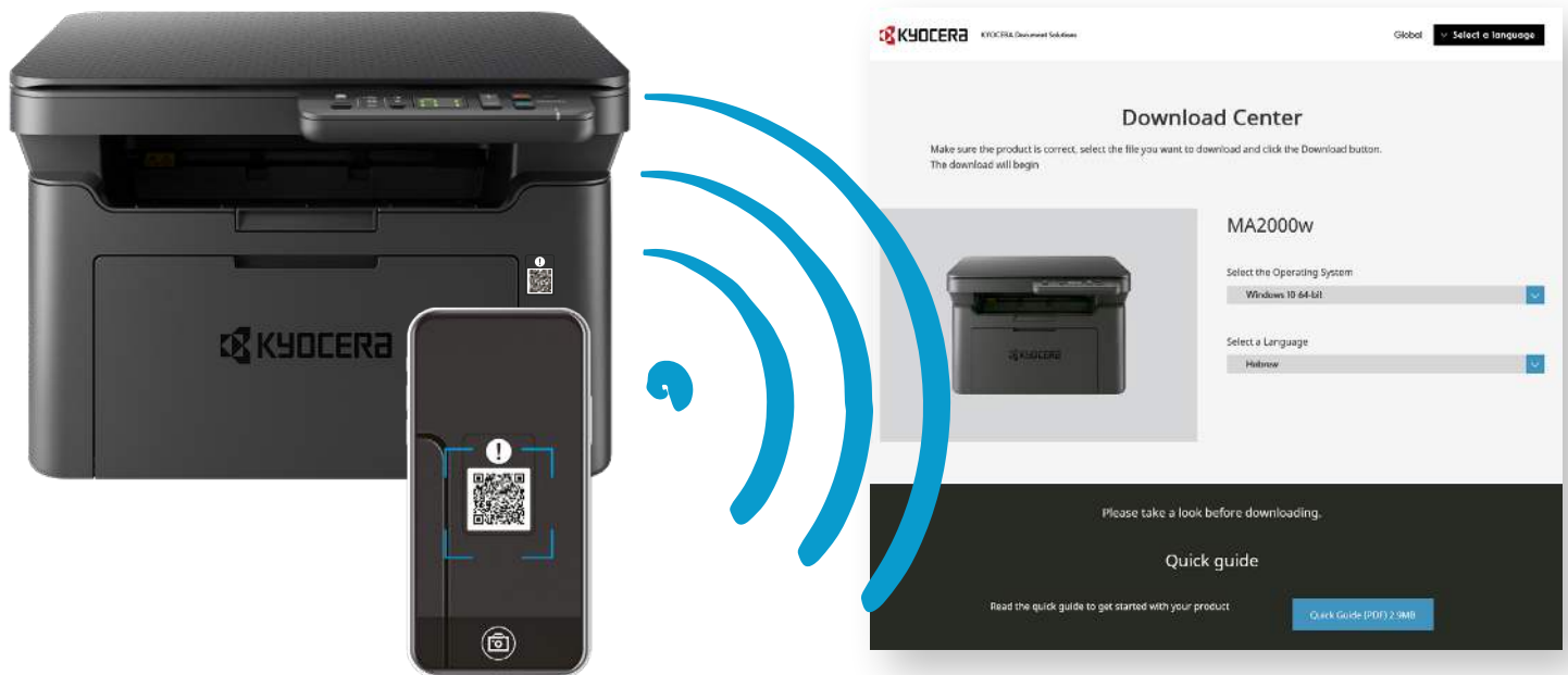
Web page - Global Download Center

Our Kyocera online download center, accessible 24/7, provides support videos for product setups, drivers installations and access to our free Client Tool utility. For easy access to the website, you can simply scan the QR code that is on the front of the printer from any smartphone or tablet.