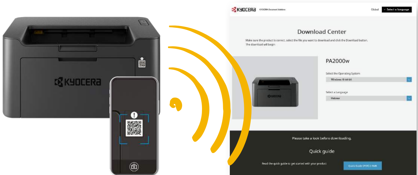
Web page - Global Download Center

By accessing the online download center, users can view a step by step video that will walk them through the installation and also easily download necessary tools such as drivers and operator manuals. Furthermore, when there is a paper jam or the device runs out of paper during usage, the KYOCERA Client Tool displays popup messages to quickly guide you toward any assistance that may be needed. There is a QR code on the front of the printer for quick and easy access to How-To-Videos right from your smart device.