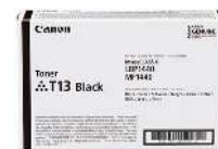
Toner T13 (Yield up to 10,600 Pages)

Canon eCarePAK Canon Extended Service Plans offer coverage beyond the standard one-year limited warranty 10 up to four years.