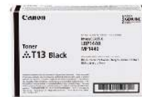
Toner T13 (Yield up to 10,600 Pages)

Canon eCarePAK Canon Extended Service Plans offer coverage beyond the standard one-year limited warranty 10 up to four years.