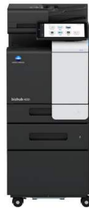
bizhub i-Series 4051i