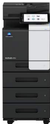
bizhub i-Series 4751i