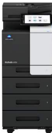
bizhub i-Series C475 1i