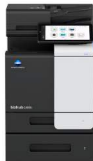
bizhub i-Series C405 1i