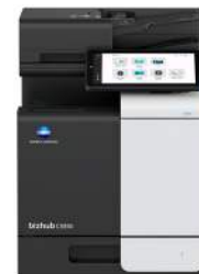
bizhub i-Series C335 1i